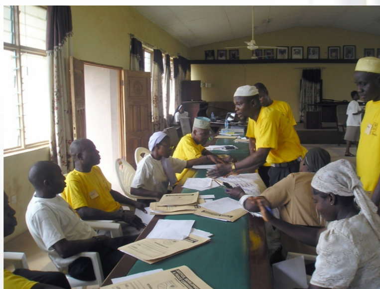
Action planning in progress during the Ibarapa East LGA training on HIV & AIDS

We say thank you to our partners, collaborators, colleagues and individual supporters who have made the unit's impact felt in their various programmes and activities. It is our dream that all partnerships will continue in the coming year 2010 so that we can have an HIV & AIDS free generation in years to come.