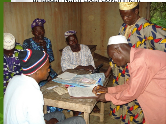
Disbursement of Agro enterprise fund at Igbodudu