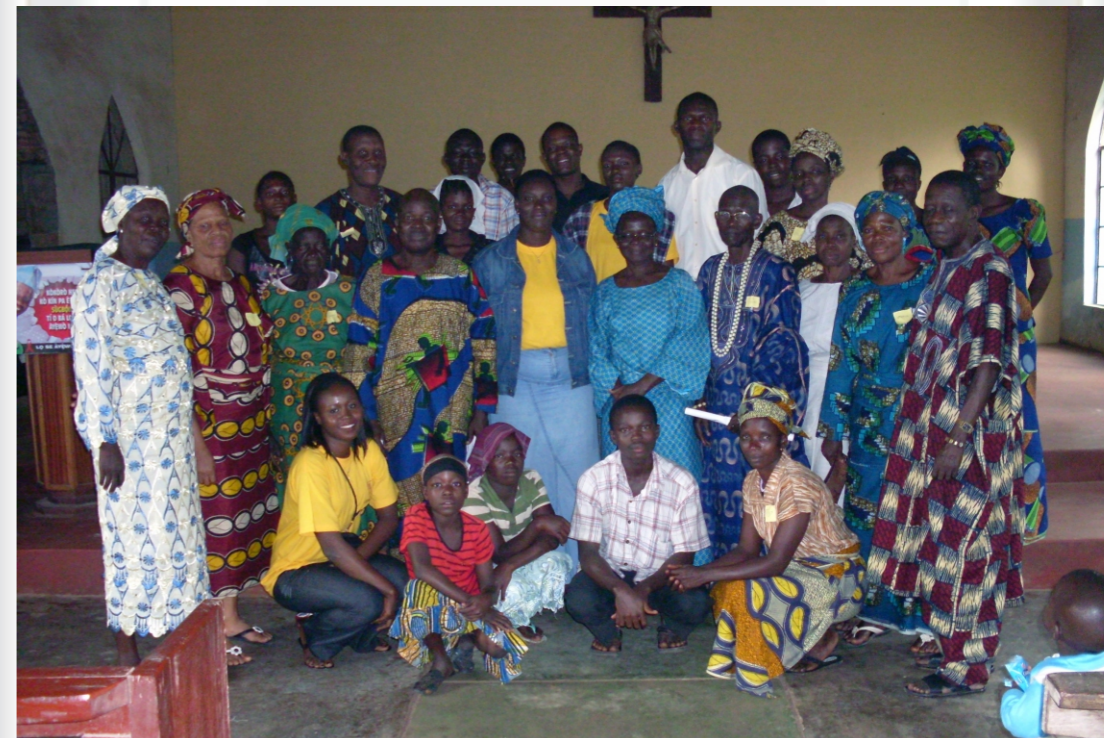
Group picture with youths, elders of the church step-down team and JDPC team