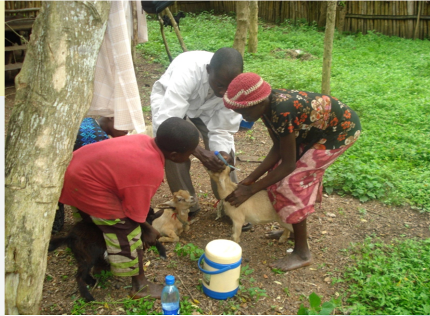
veterinary services for goats in confinement, Ikire zone