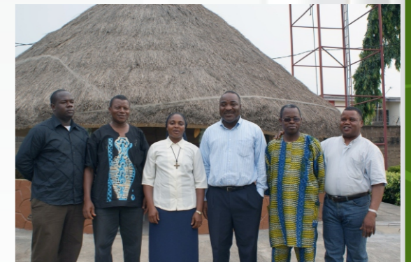
Group of Coordinators of JDPC, Onitsha Province on a learning visit to JDPC, Ibadan