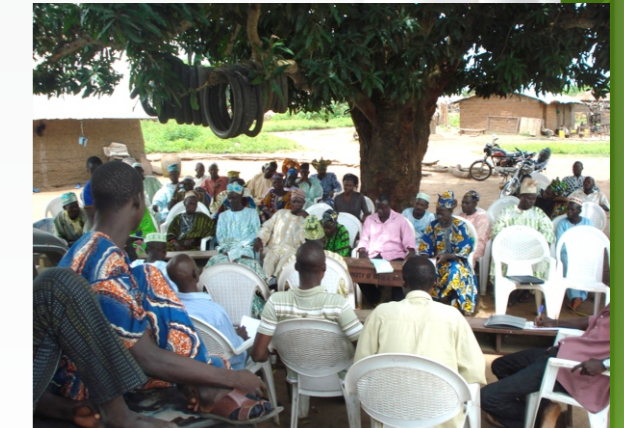
Exchange visit - Platform for learning and experience sharing