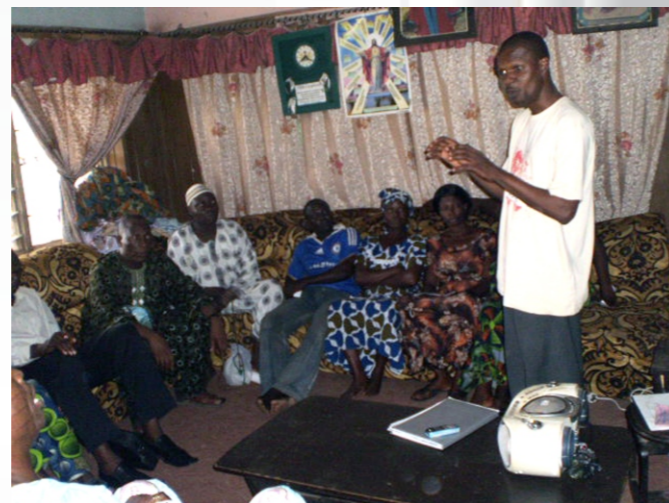
JDPC Programme officer providing information to Ibadan NE C.C.G.G meeting at IDIOSAN