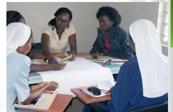
Staff and Participants at a group discussion during an in-house training on Project Design