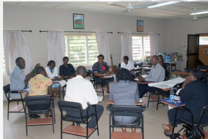
The academia discourse on FGM