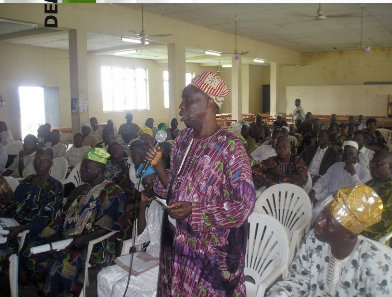
Floor contributions during the Constituency Cultivation Programme at Akinyele LGA in Moniya.