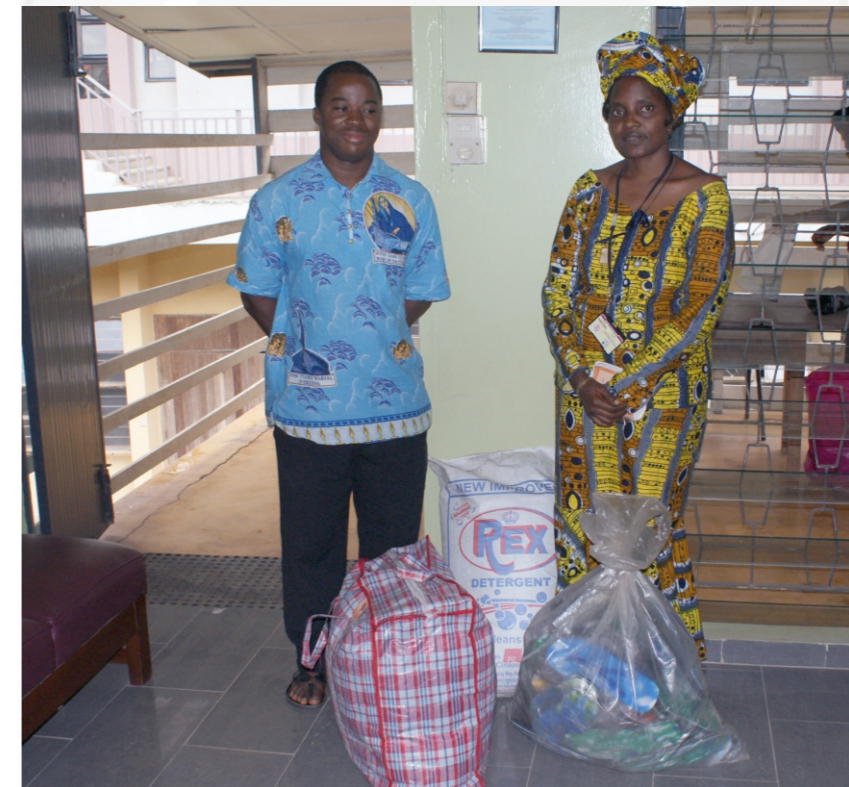
Donation to the Welfare unit for the Inmates