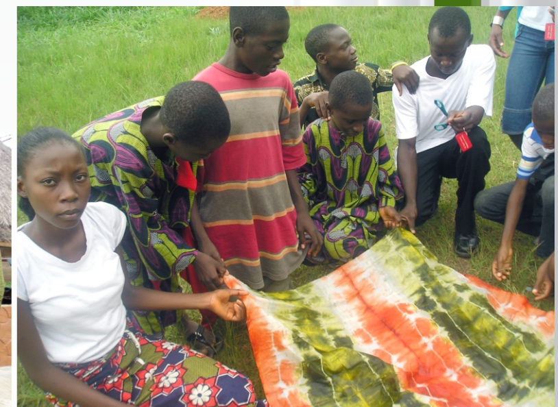
Tie & Dye session