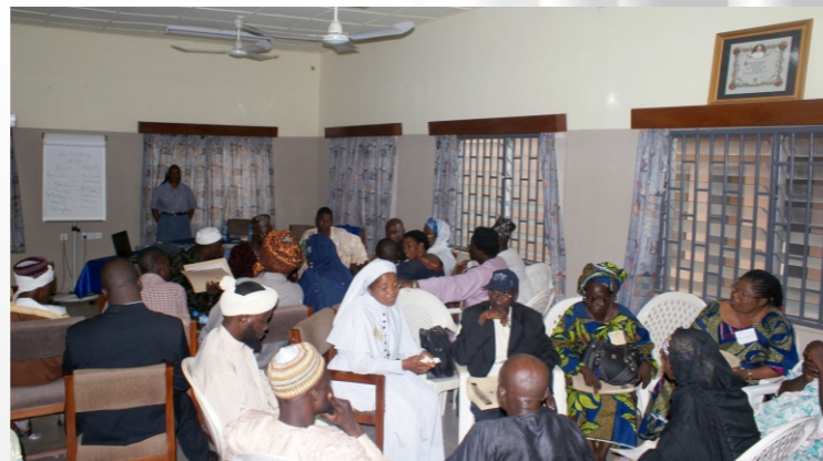
Cross Section of Participants at a sensitisation workshop on HIV & AIDS