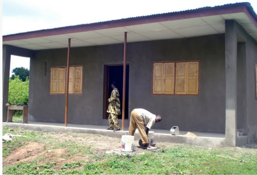
Completed Health post at igbodudu- a MANOS UNIDAS and JDPC intervention