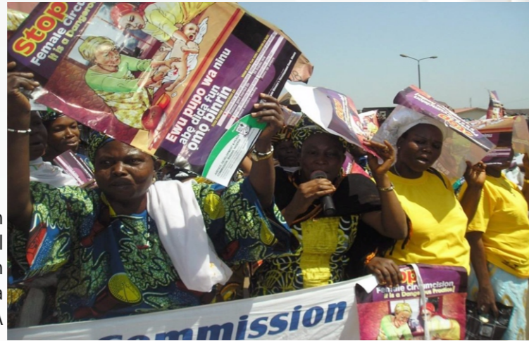
street rally on Female Genital Mutilation in Ogbere, Ona-Ara LGA