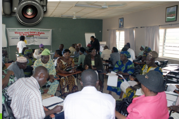
Group Discussion at a Workshop on Women and Child's Rights