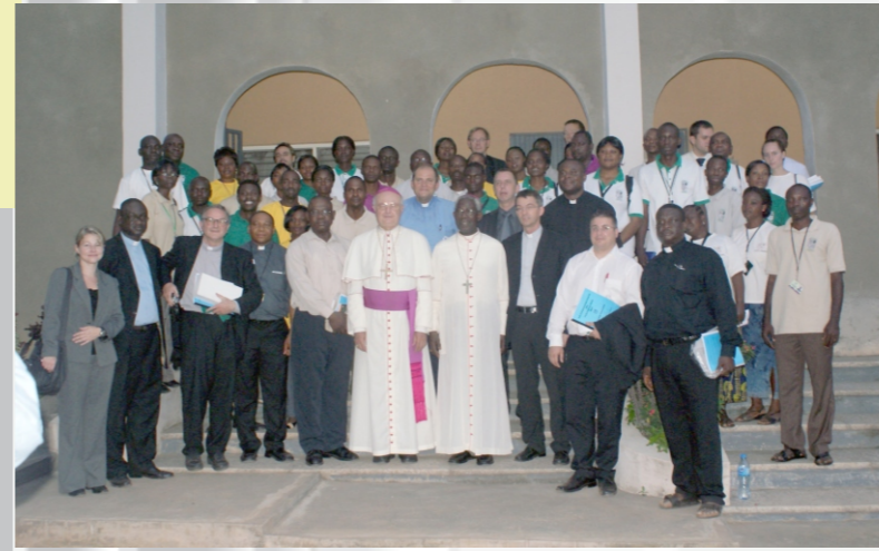
German Bishops' delegation with members of staff