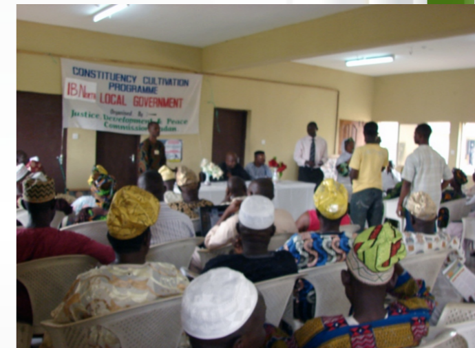
Hon. Demola Omotosho, Chairman, Ibadan North Local Government at the Constituency Cultivation Programme