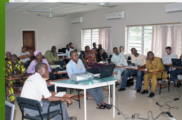
Staff listened raptly at the Strategic Planning Session