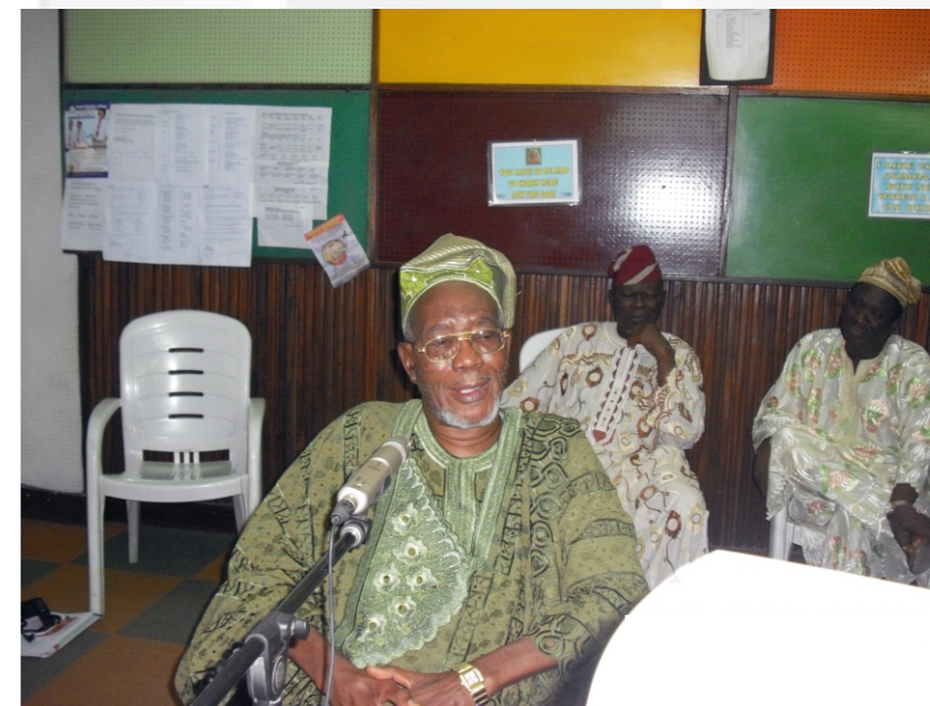
Lam Adeshina, former Oyo State Governor on Vision Nigeria