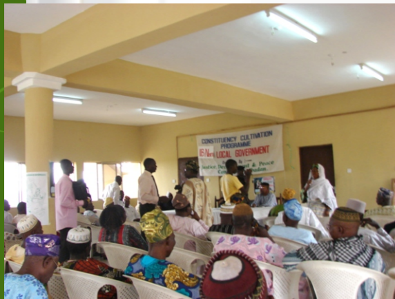
Constituency Cultivation Programme at Ibadan North Local Government