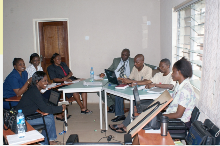
Staff at the Strategic Planning Session for the year