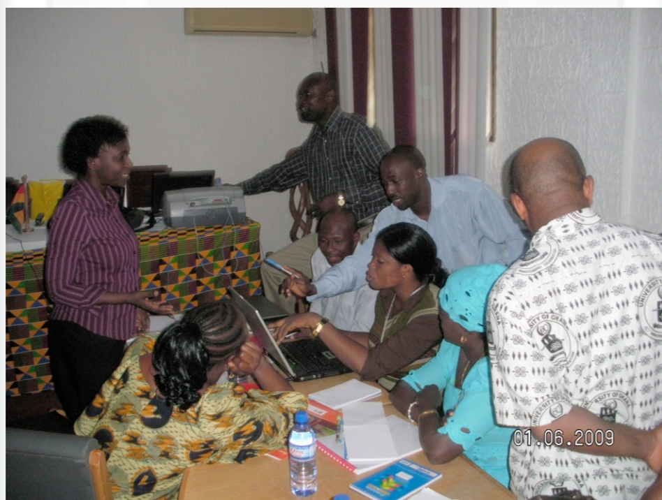
RUAF-FStT 2nd Regional Training in Aburi, Ghana