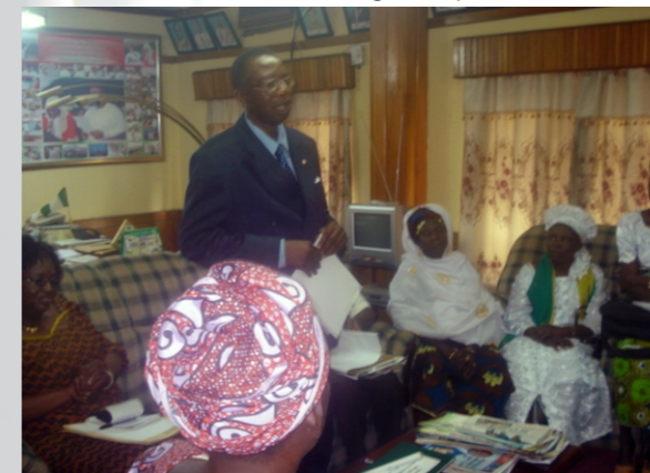
IDP women farmers on advocacy visit to Oyo state ministry of Agriculture