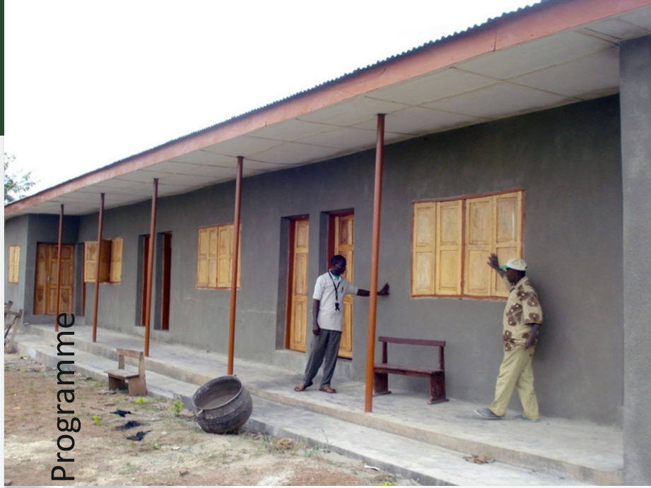
Completed 3 classroom block at Olabode Gaadi- a MANOS UNIDAS and JDPC intervention