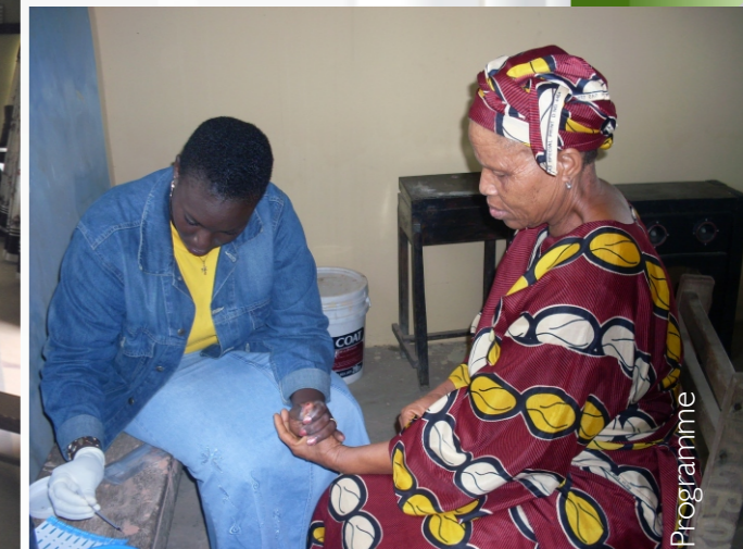
HIV Counseling and Testing (HCT) in progress