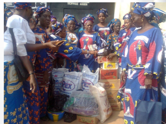
Donation to the inmates by the Catholic Women Organisation, Ibadan Charter during the Christmas Party at Agodi Prison