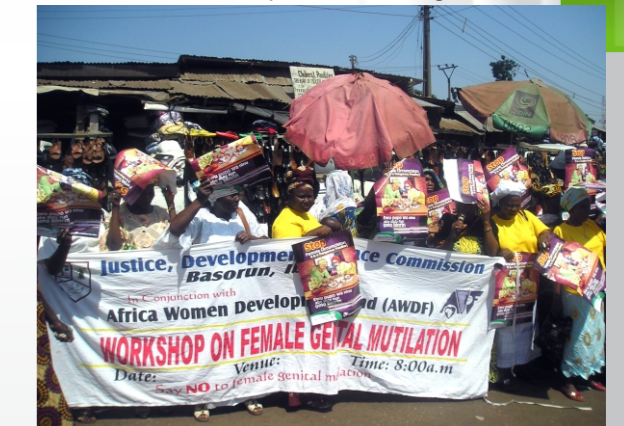
FGM Rally at the Market in Igangan