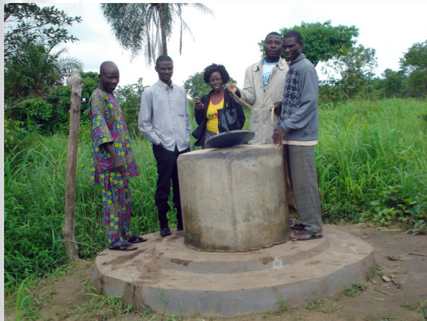
Completed well at Onitabo Igboasan in Lanlate- JDPC-MANOS UNIDAS Intervention