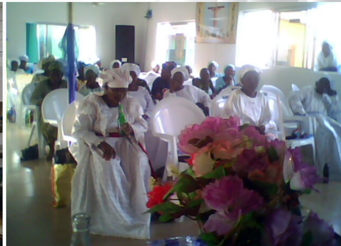
Cross section of female participants at the OAIC step-down