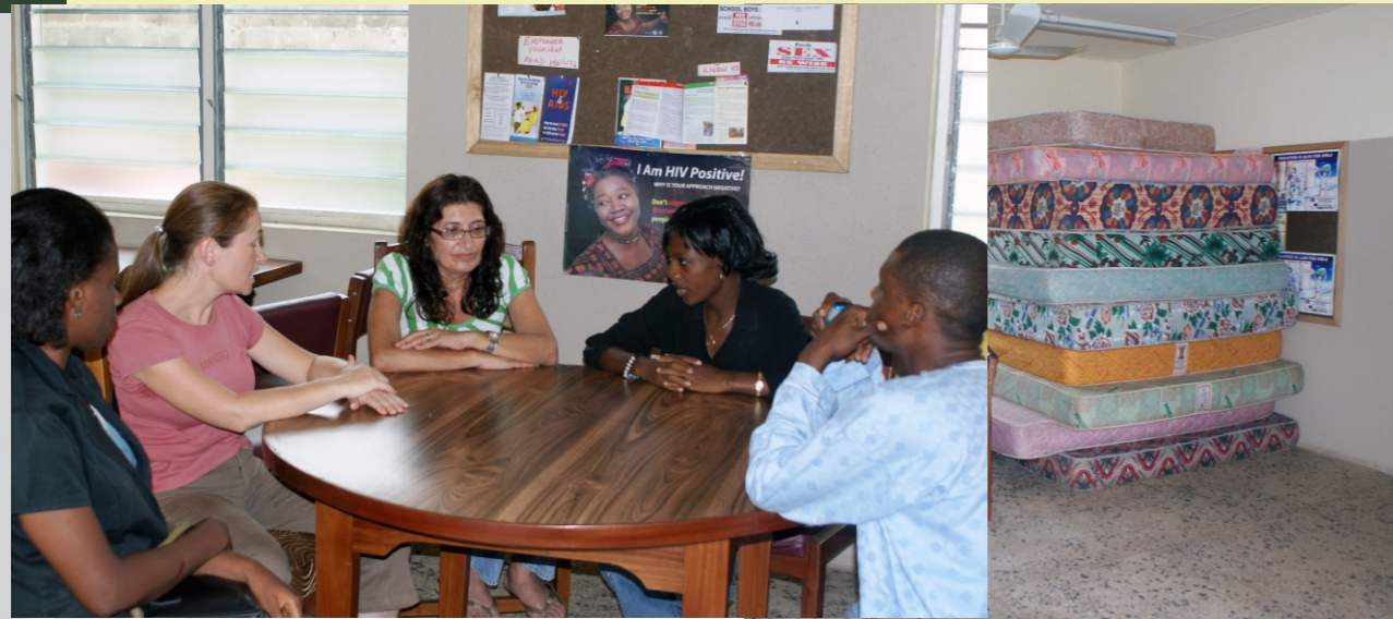
Members of staff with donors interested in the well being of the children of the Remand Home with items they brought