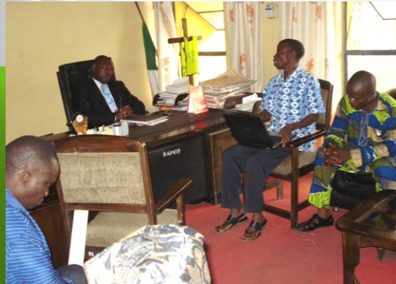
IDP - Advocacy Visit to Irewole Local Government Chairman, Ikire