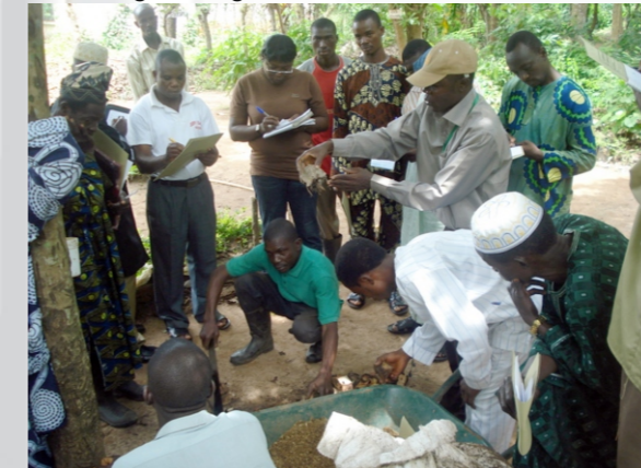
IDP farmers on practical session during capacity building on seed and seedling multiplication