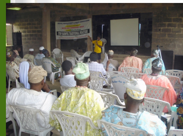
Female Genital Mutilation workshop, ibarapa 09 052