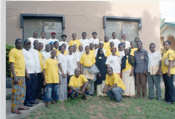
Group picture of participants and resource persons at a training for Religious Leaders on HIV & AIDS awareness