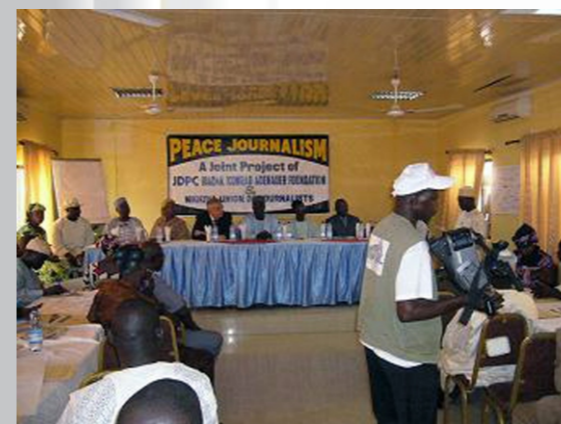
Opening Ceremony of the Peace Journalism Workshop in Iwo