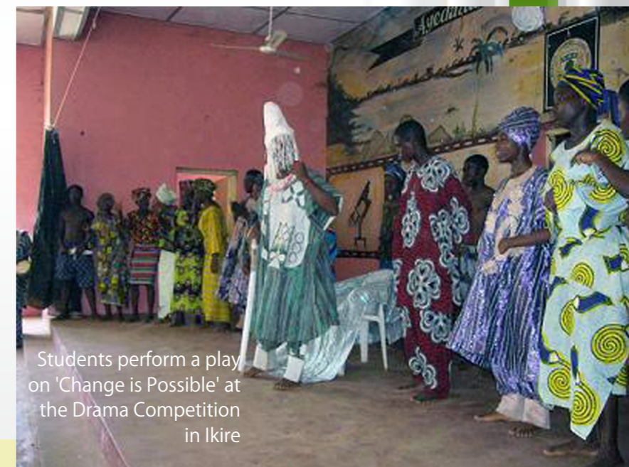
Students perform a play on 'Change is Possible' at the Drama Competition in Ikire